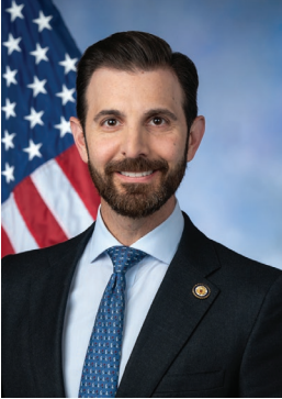
Congressman Chris Deluzio Pennsylvania's 17th Congressional District

I'm Congressman Chris Deluzio, and I represent a great Western Pennsylvania district and serve on the House Armed Services Committee down in Washington. It is my honor to help kick off the Opening Reception at the 2026 Showcase for Commerce and help welcome everyone to this storied event.